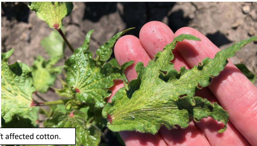
Herbicide drift affected cotton.

Unfortunately, the difficulties from rain and flood events over the past few months have meant that weed control in fallow fields has been lacking. There is therefore a crossover of harsh chemical use and young cotton crops. For example, Group 4 herbicides used in fallow fields with cotton crops nearby.