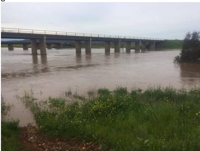
The Mooki river at Pursehouse crossing