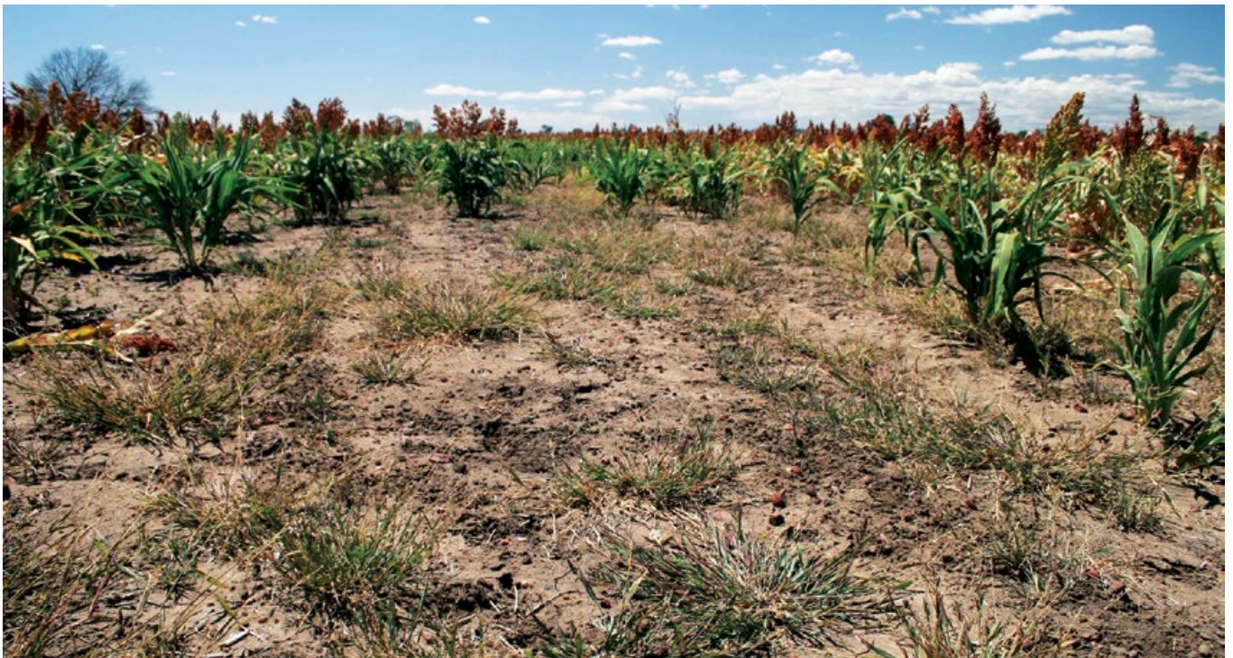
Since the first confirmation of glyphosate resistance in awnless barnyard grass, many other resistant populations have been found.

"You could run BYGUM with a different set of assumptions that fit your experiences, and see if the results change."